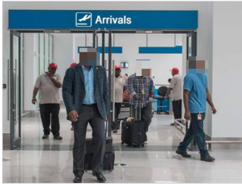
In public areas, e.g. airports