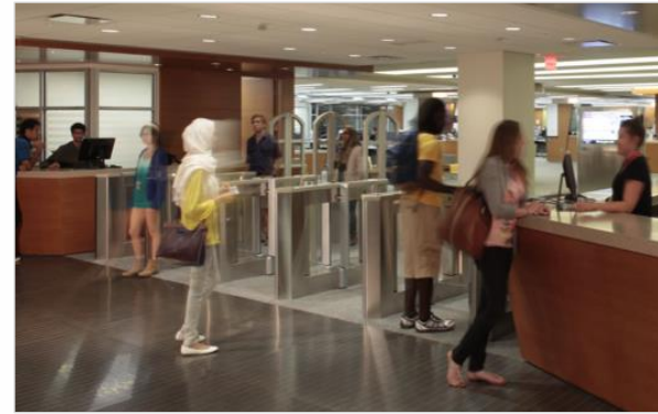
In connection with access control systems