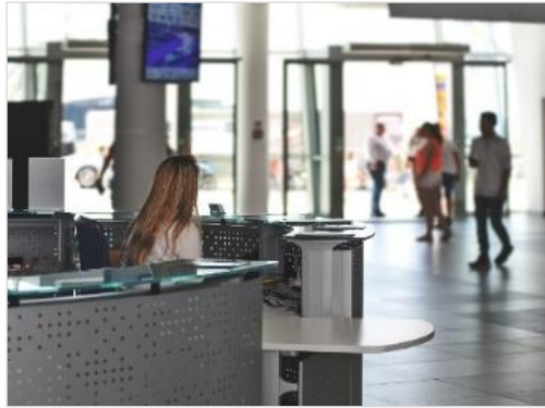
In entrance areas of public buildings