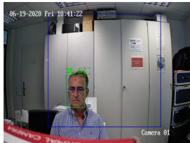
Measurement of body temperature by means of thermal imaging camera